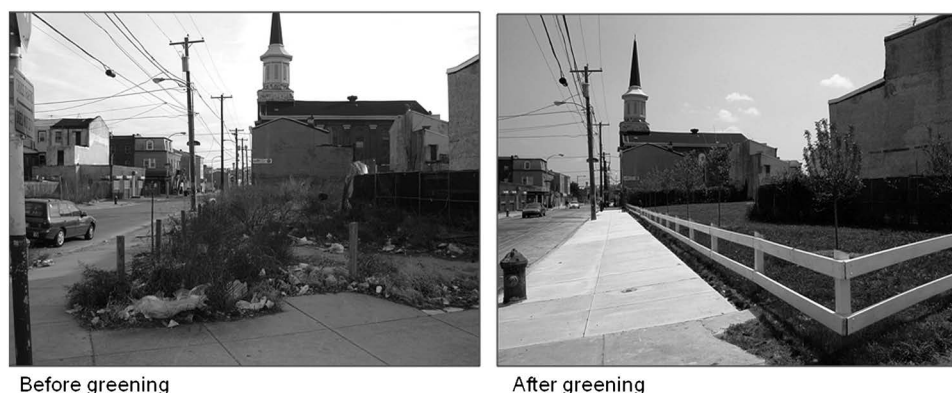
Figure 1 Before and after vacant lot greening by the Pennsylvania Horticulture Society.

Bureau of Revision of Taxes, the Philadelphia Department of Licenses and Inspections, and the US Postal Service records, and was maintained by the Cartographic Modeling Lab at the University of Pennsylvania. To be selected for randomisation, vacant lots had to meet the following eligibility criteria: (1) location in one designated section of the city (Philadelphia has a total of five geographic sections), (2) at least one city code violation, (3) no prior greening efforts by the PHS or the City of Philadelphia and (4) at least 4500 square feet of vacant lot space within a surrounding 660 square feet buffer. After exclusion criteria were applied to the master database, 2814 vacant lots remained. These vacant lots were randomly sorted and the top 50 served as index vacant lots. Index lots were grouped with other vacant lots in closest proximity to create 50 clusters each totalling 4500–5500 square feet of vacant lot space.