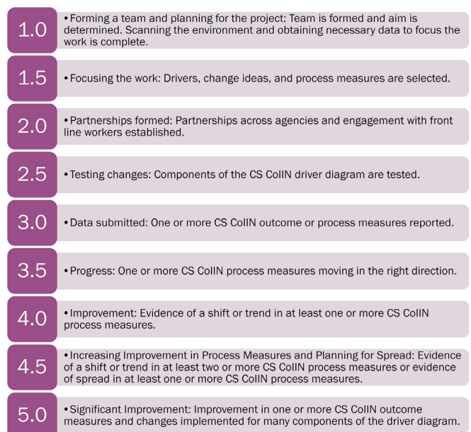
Figure 2 The CS CoIIN Progress Scale note 1. The CS CoIIN Progress Scale was adapted from the IHI BTS model. 29

along process measures within 1 year. This was achieved through application of the CS CoIIN framework that utilized the collective impact approach, 11 BTS, 9 and MFI 8 with three key adaptations. The first adaptation was to broaden the group of stakeholders who develop the driver diagrams and measurement strategies to include both subject matter and application experts from the National Coordinated Child Safety Initiative Steering Committee, CSN, HRSA and state/jurisdiction practitioners in order to address the challenge of translating research into practice across multiple injury and violence prevention topics. The second adaptation was to use a blended delivery model that replaced two face-to-face learning sessions with 4-hour virtual meetings, to facilitate increased participation. A third adaptation that emerged midway through the CS CoIIN was creation of a CS CoIIN progress scale to reflect working in a complex, multisectoral environment at the population health level. The scale recognizes early work should focus on states/jurisdictions aligning CS CoIIN activities with strategic plans, scanning and assessing their environments and building partnerships. 8